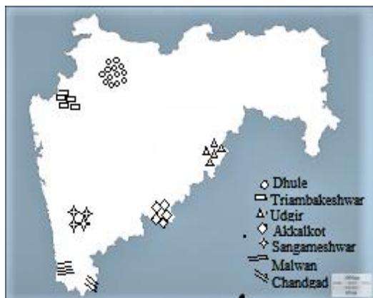
Fig. 1 Sampling areas from the Marathi Dialect Survey used for the present study

The present paper considers synchronic dialectal data from: Chandgad (Dist. Kolhapur), Malwan (Dist. Sindhudurg), Sangameshwar (Dist. Ratnagiri), Trimbakeshwar (Dist. Nasik), Dhule (Dist. Dhule), Udgir (Dist. Latur) and Akkalkot (Dist. Solapur). (Please refer to the map in Figure 1; map not to scale).